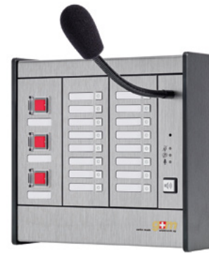
APS-316.2-3AL-EV Wall mounted version